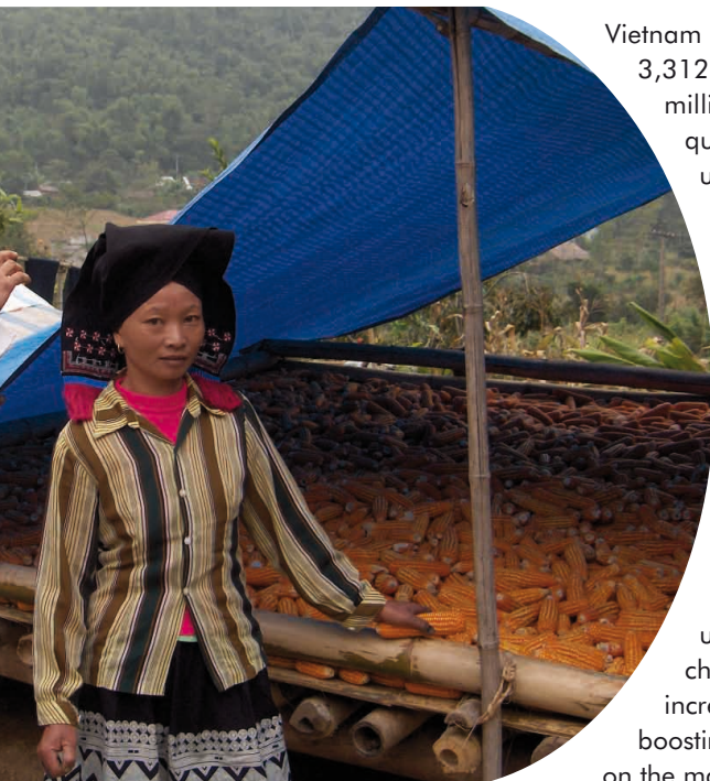
Proper post-harvest storage is indispensable for obtaining a quality product. Drying of corn ears before they are processed for flour. Cao Son village, Vietnam.

Market incentives are motivating producers, traders, carriers, and service and processing enterprises to organise effective value chains. Besides generating profit for producers and intermediaries, these value chains also ensure sufficient supplies for urban consumers in terms of both quantity and quality.