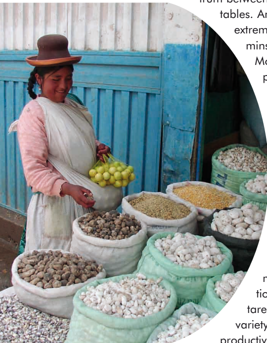
Potatoes are usually difficult to store, but when they are prepared as chuño, they can be kept for several years without deteriorating, thus constituting a food reserve for the local population.

Varieties cultivated at high altitudes, often by the poorest communities, are rarely commercialised and are used predominantly for household consumption. While they are essential for nutrition, they also have an important cultural function. However, potatoes from large-scale production or imported from abroad (Canada, USA, Colombia and other neighbouring countries) are increasingly present on local markets. Available at a low price, they are inducing increasing numbers of farmers to give up cultivation of native varieties. This in no way improves the living conditions of populations seeking the means to be actors in a regional or national market that is constantly evolving.