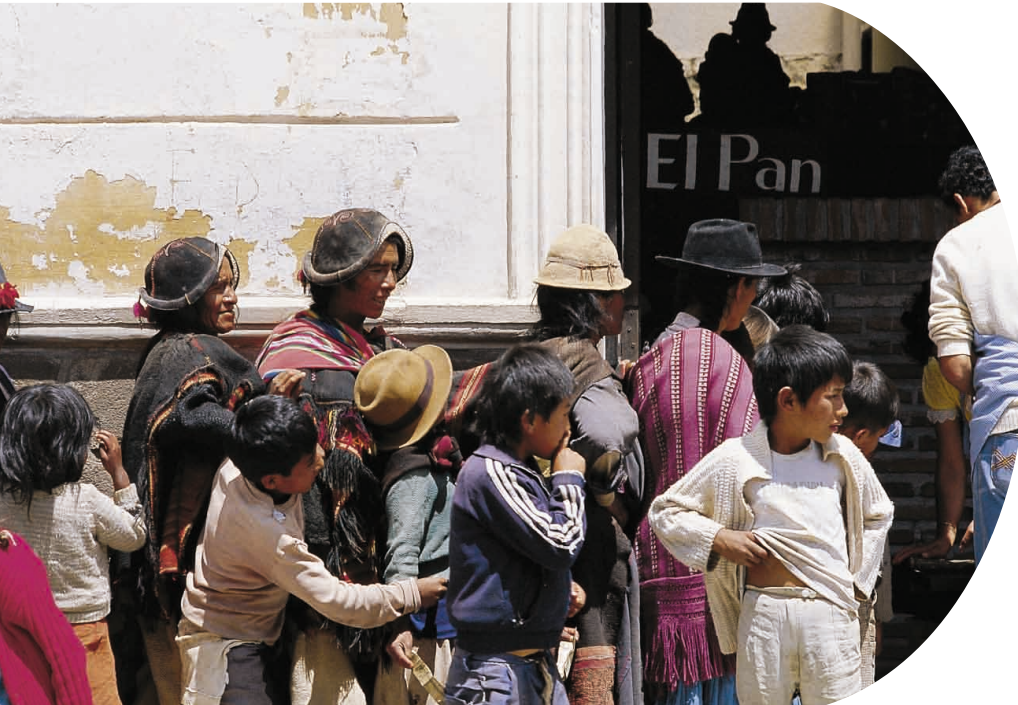
Bolivian citizens queuing up for bread.