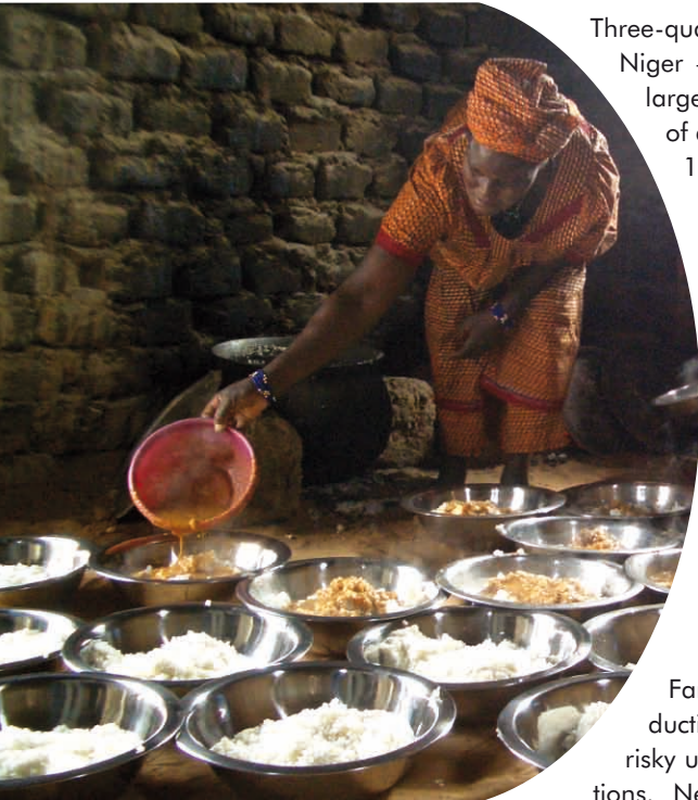
Niger: distribution of a meal in a school.

In particularly bad years Niger is rapidly confronted with an acute food crisis, as was the case in 2004. During that critical year, crops were doubly affected – first by prolonged drought and then by a cricket invasion – leading to a famine that threatened a large part of the country’s population.