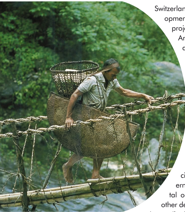
Food, medicine, construction material and information cross a bridge – often a village's only open door to the outside world.

Both Nepal and Switzerland are resource-poor countries, endowed with few raw materials and limited agricultural resources. From a historical point of view, the road to food security is long and paved with numerous social obstacles as well as ecological and economic risks. Nepal is encountering the same kinds of problems Switzerland encountered in the past. Food security is never definitively attained: it is constantly put to the test by new circumstances.