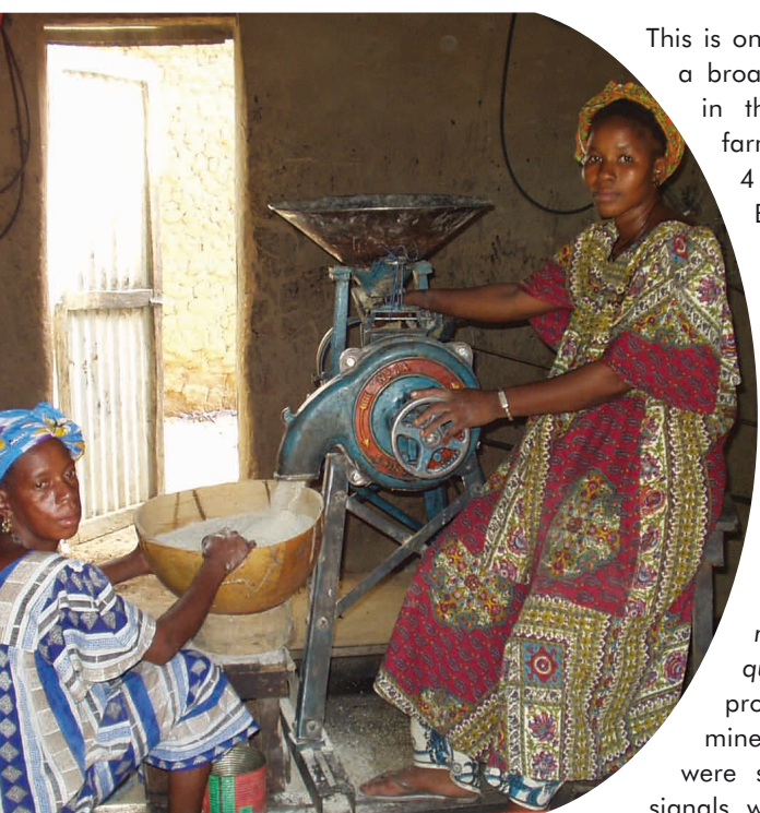
A women's group runs the village cereal mill.

Food security has not yet been attained in Burkina Faso. The country remains one of the poorest on the planet and currently imports US$ 78 million worth of cereals each year, amounting to a total of approximately 250,000 tonnes of rice, wheat and maize. However, the government and international funding institutions are focusing exclusively on cotton and its price on the international market; cotton is the only product for which the state has a national policy and instruments to support production. While cotton is the main source of state revenue, sales of food products account for 80% of farmers' income.