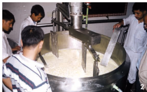
Indo-Swiss Project Sikkim: www.intercooperation.ch/offers/download/ic-india