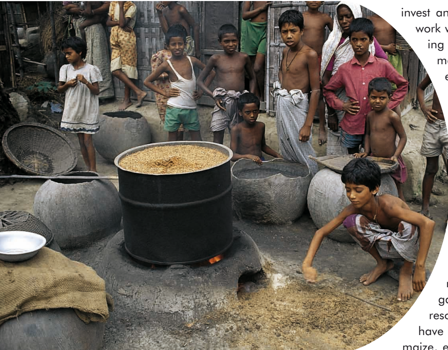
Processing of a harvested crop: rice is cooked to make husking easier. Bangladesh.

invest and progress; often too low for them to live on their work with dignity, renew their means of production (including buying quality seeds for the next sowing season) and maintain their market share; and too low for them to even properly feed themselves. Indeed, half of the world's farmers – i.e. those who are the least equipped, least adapted and have the least access to suitable land – do not have enough to eat. The survival of a rural household whose income falls below the level of renewal is only possible at the price of converting capital goods to cash (i.e. by selling livestock, reducing or not maintaining farm implements, etc.), under-consumption (farmers in rags, unkempt children who do not attend school, etc.) and finally undernourishment. If sending the younger generation to work in town does not ensure the survival of rural families, farm abandonment and exodus usually follow. In certain cases, illegal crops such as coca, poppy and hemp are the last resort. Thus, in the past 60 years, over 80 poor countries have become major importers of staple foods (wheat, rice, maize, etc.). "In those countries where agriculture is still the dominant source of food and livelihoods, dumped imports under-