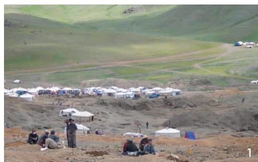
The SDC in Mongolia: www.sdc.mn

On average, the income from milk sales amounts to US$16–25 per month and family. This represents a substantial part of a household’s budget. The cheese factory has a production capacity of 400 kg of cheese per day. It has a partnership with the largest dairy cooperative in India, which offers technical backstopping and professional management, and ensures reliable access to markets in large cities. The project has helped to strengthen the production system, making cash income from milk sales more secure and improving supplies of high-quality food products for urban consumers.