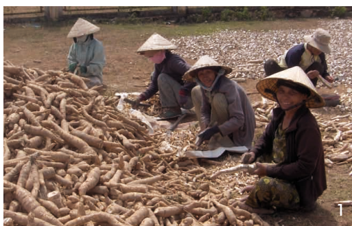
1. Women peeling manioc tubers and cutting them into fine slices. After the slices have been sun-dried (in the background), they are processed as chips. Cu Kty village, Vietnam.