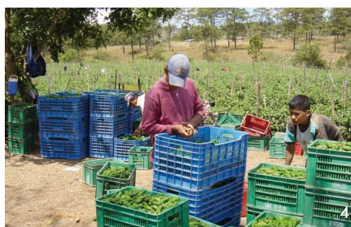
4. Harvesting and preparing of gherkins for transport. AGROPYME, Honduras.

In Honduras, a country with abundant natural resources, Swisscontact is implementing a project called AGROPYME. Launched in 2001, this project focuses on the development of value chains for vegetables and fruit. One of the objectives pursued by AGROPYME is to replace imports supplying supermarkets in the country’s capital. Moreover, the project also supports production of goods that arouse interest on foreign markets – such as melons and watermelons, which are produced for the United States and Europe. Two exporters and thirty producers have joined forces in a new association to organise their value chain. In Danli, women’s groups have also benefited from support for processing and distribution of banana chips. This has secured new income, while at the same time satisfying a considerable local demand.