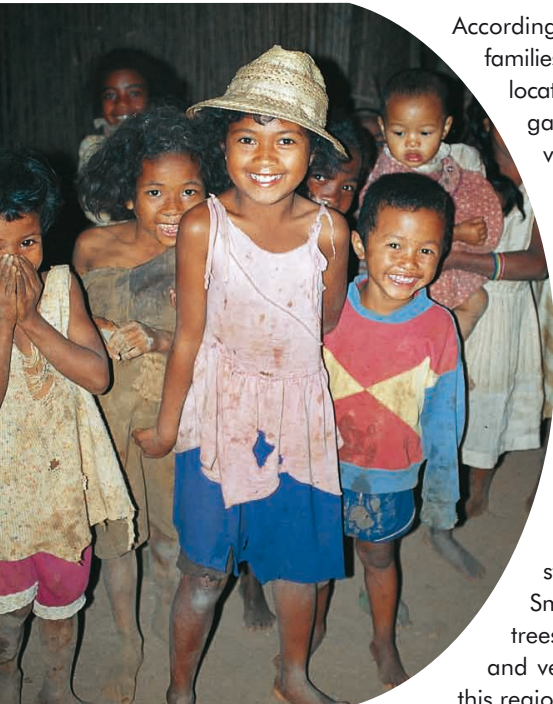
Children are a country's future! They are the most vulnerable group with regard to nutrition.

Food security depends mainly on efficient organisation and close collaboration between local communities, civil society, decentralised administrative units and governmental services. Strengthening and structuring organisation in rural areas is of vital importance in the nutritional sector, especially for particularly vulnerable local communities.